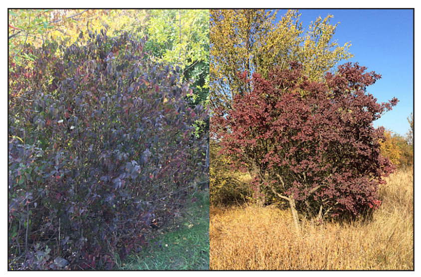
Figure 3. Bushes: a svidina blood-red (left) and sumac leather