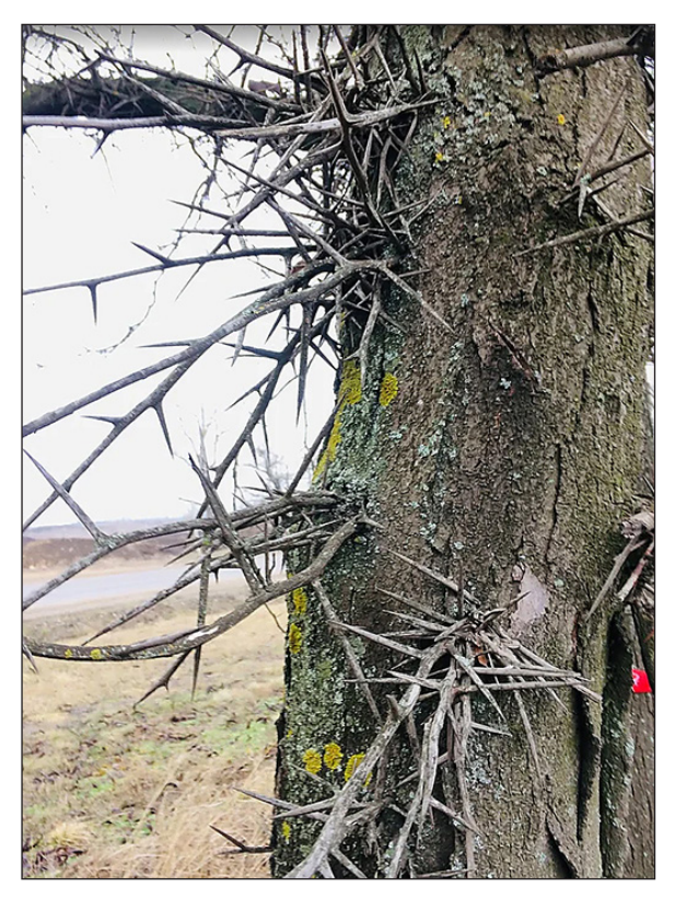
Figure 7. Trunk of gleditsia tahkoluoto

From the list of plants with an age of 50 years, the best condition is noted in Gledichia trifoliata and holly maple (the average score of the condition category is 1.5). The Ta-Tarsky maple is also in satisfactory condition, with an average score of 1.8.