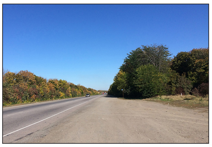
Figure 6. Forest strip on plot 3 (right)