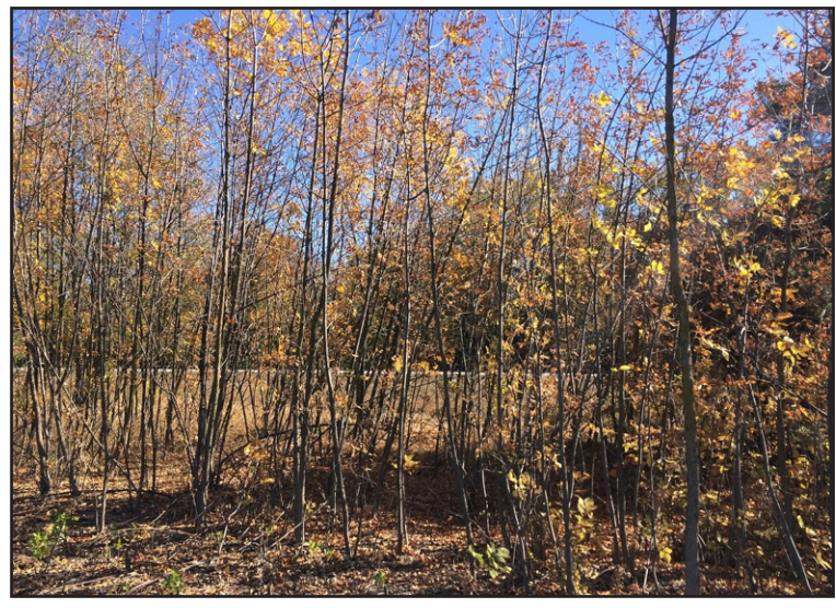
Figure 4. Self-seeding of lanceolate ash