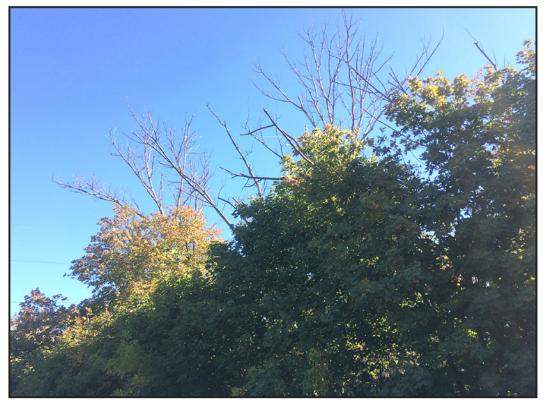
Figure 5. Forest strip on plot 1. Massively dry-shingled Black poplar