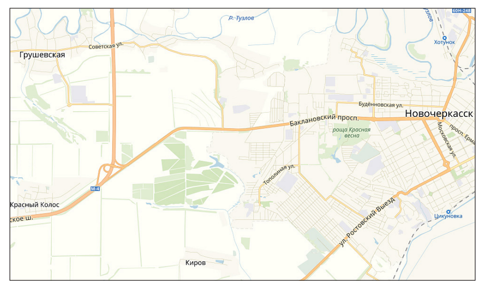
Figure 1. Situational diagram of the location of the object of research

equal to the base of the measured plant (10 m) is measured from the tree. The diameter of the trunk at a height of 1.3 m is measured with a fork in two perpendicular directions along one-centimeter steps of thickness.