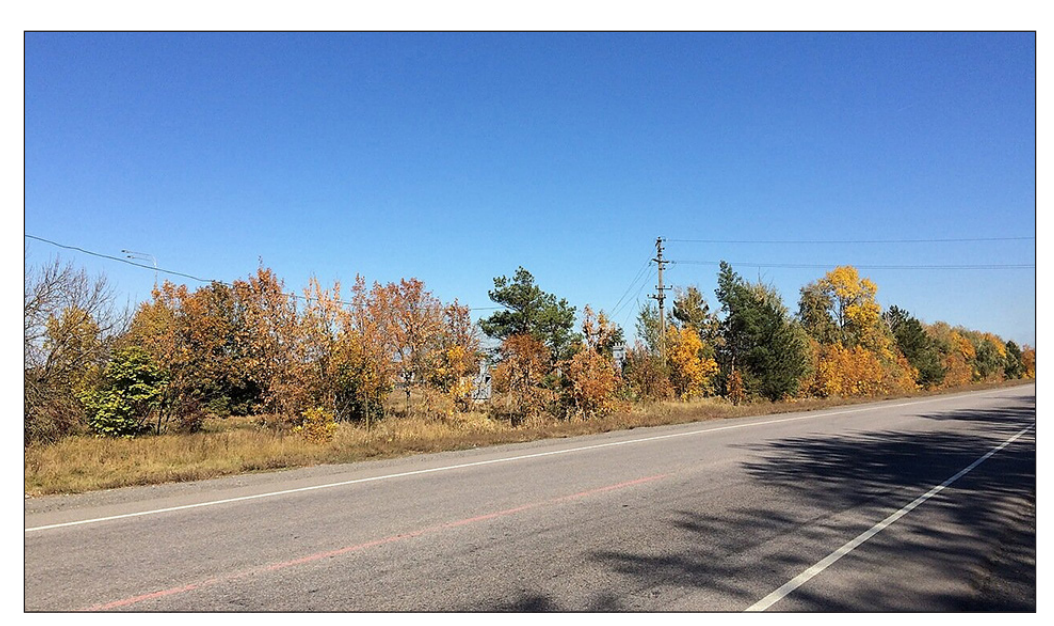
Figure 8. Forest strip on plot 7. General view

The range of woody and shrubby plants in roadside forest stands should be expanded. Thus, red oak has a decorative effect in the autumn period, along with Crimean pine; the introduction of ordinary pine will be successful.